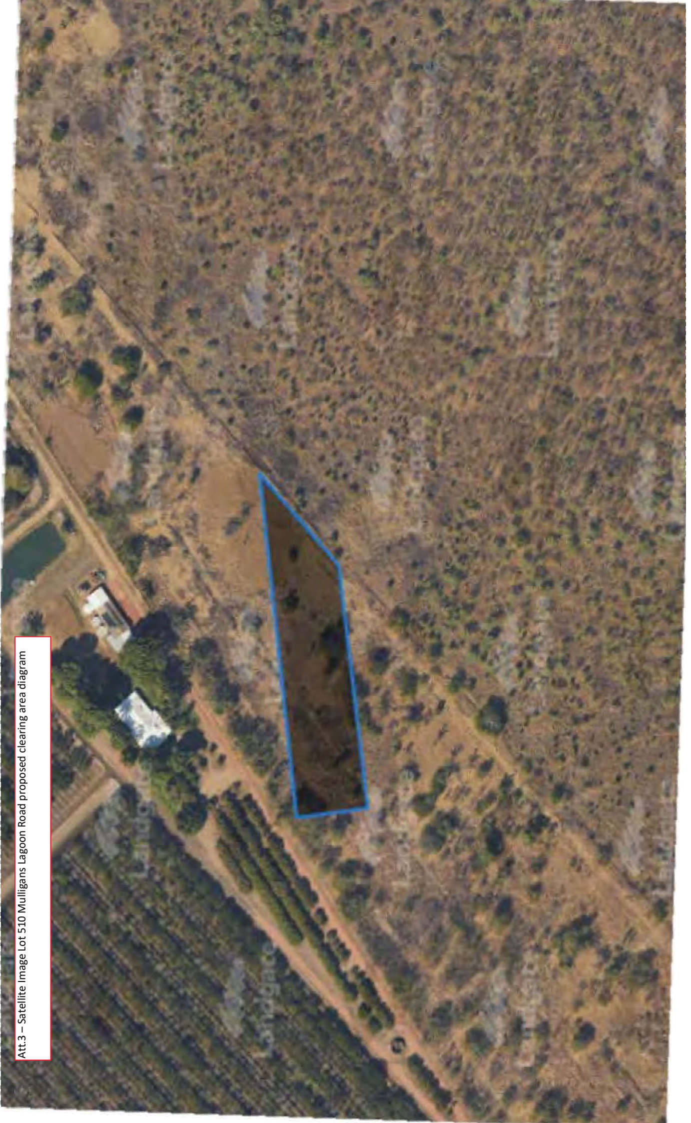
Att3 – Satellite Image Lot 510 Mulligans Lagoon Road proposed clearing area diagram